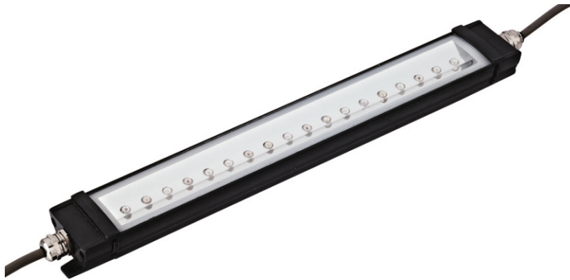
LLR42, 24 VDC