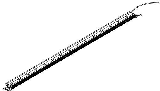
lateral cable outlet