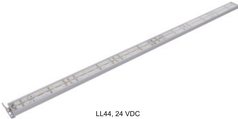
LL44, 24 VDC