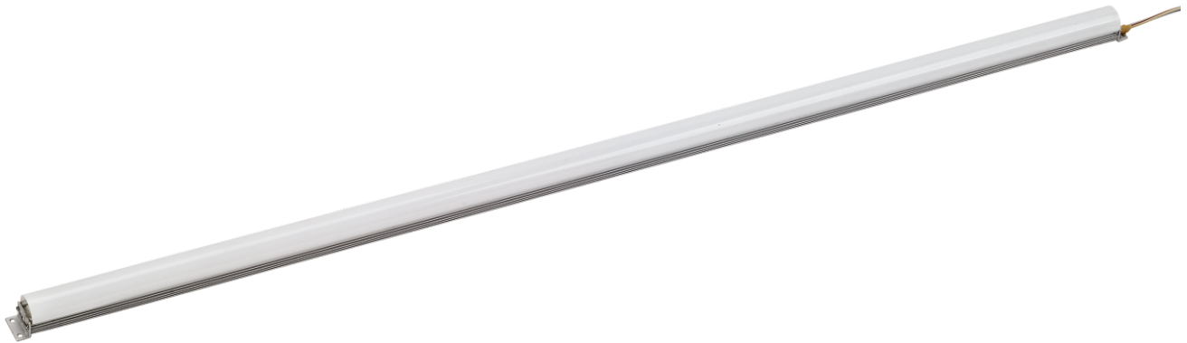
LL26C, 24 VDC