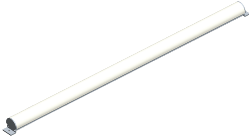
LL22C, 24 VDC