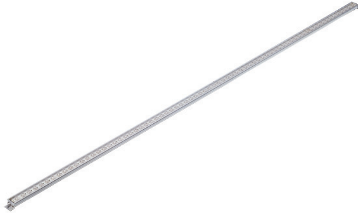
LL22, 24 VDC