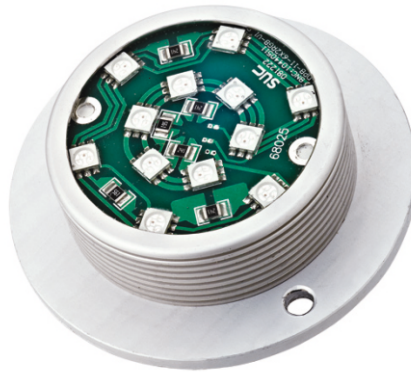
ABL75, 24 VDC